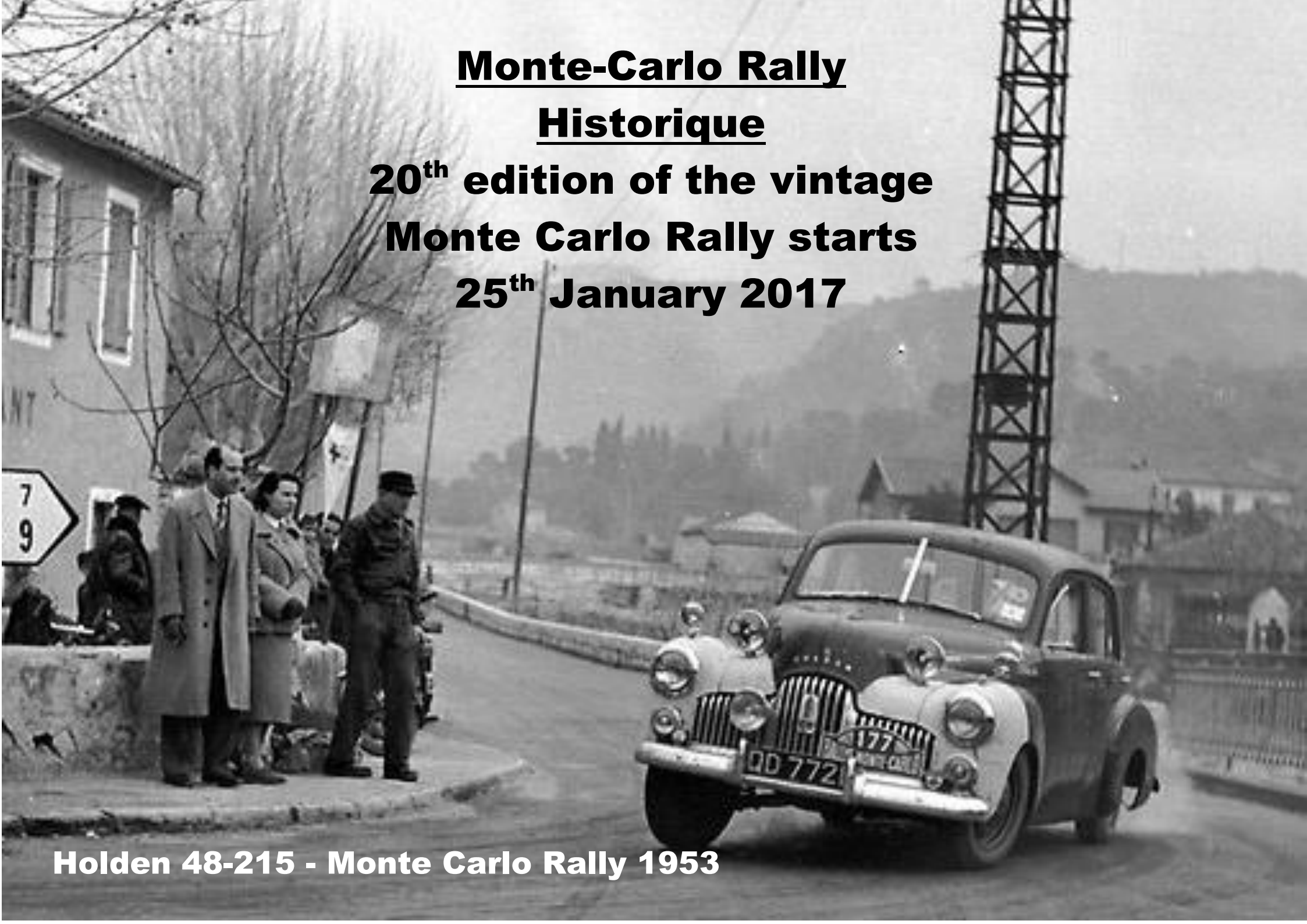
Holden 48-215 - Monte Carlo Rally 1953

20 th edition of the vintage Monte Carlo Rally starts 25 th January 2017