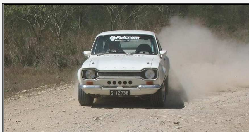
GCTMC members in action at the Tanah Keta Khanacross, Pimpima